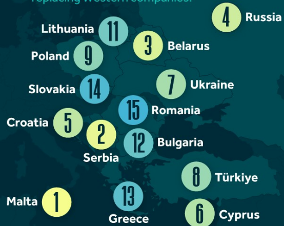
Real GDP, annual % change (forecasted)

Despite sanctions, Russia's economy has grown through trade with China & India, along with the expansion of local businesses replacing Western companies.